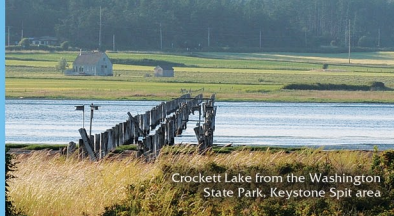
Crockett Lake from the Washington State Park, Keystone Spit area

For field trip information, please visit: www.whidbeyaudubon.org