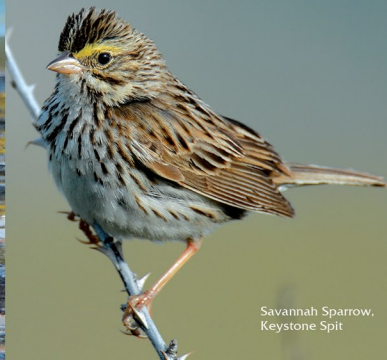
Savannah Sparrow, Keystone Spit