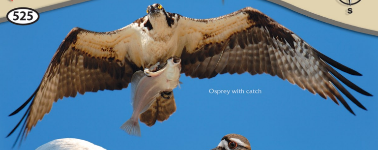
Osprey with catch