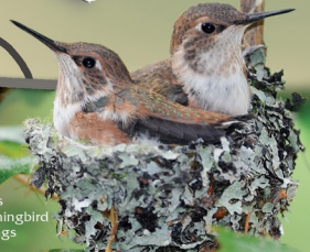
Rufous Hummingbird nestlings