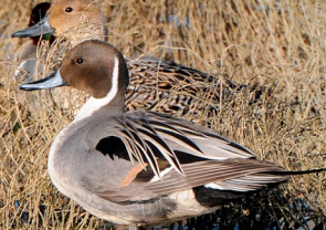
Northern Pintails, male & female

Printed using soy inks on FSC paper.