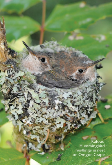
Rufous Hummingbird nestlings in nest on Oregon Grape

Native shrubs and naturally occurring duff (the collection of leaves, seeds and other compostable materials that fall to the ground) are places where birds can forage for food. Duff also absorbs storm water runoff and reduces soil erosion.