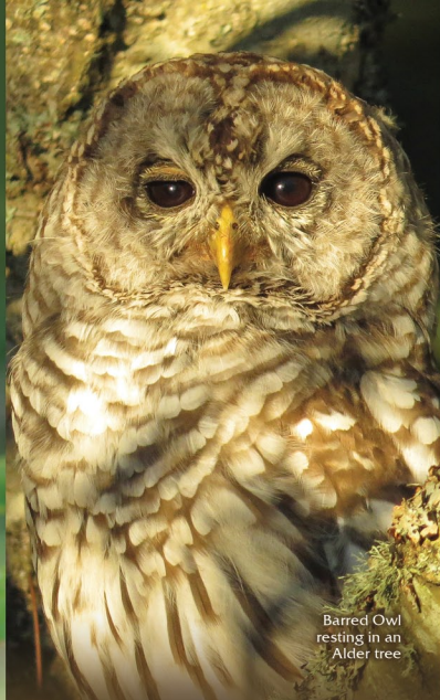
Barred Owl resting in an Alder tree